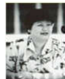
Born able-bodied, Sreen suffered a stroke in her late teens while swimming.