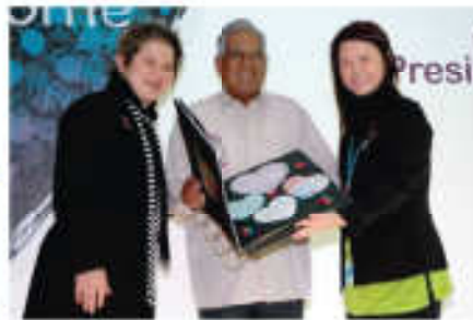
His Excellency President Nathan of Singapore Visit to PaTH's Event: Art With A HeART