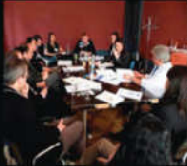
Schwab Social Entrepreneurs Summit, Davos