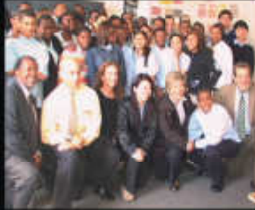
Operation Hope Financial Literacy Program