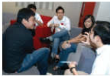
Social Entrepreneurs sharing personal experiences.