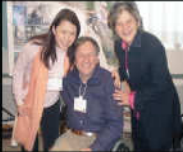
SIP-Schwab Entrepreneurs, Davos