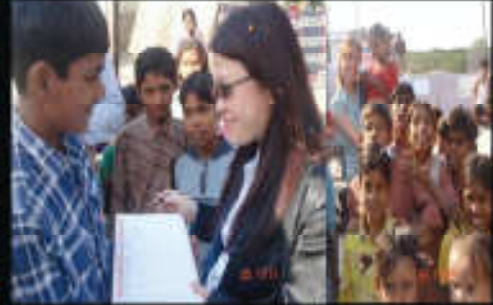
SIP-YCL, Dignity Day, New Delhi