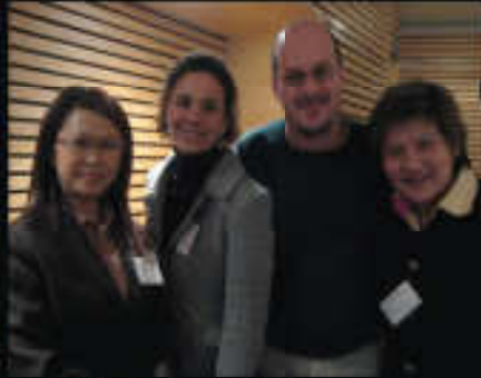
Skol World Forum on Social Entrepreneurship, England