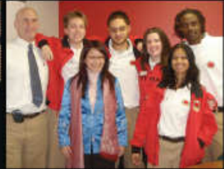
City Year, Boston