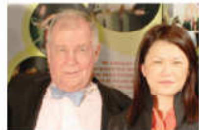
Interview with Jim Rogers Co-founder, Quantum Fund Creator, Rogers Commodity Index