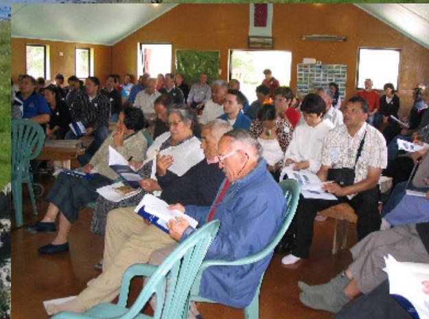
12th APEC Women Leaders Network (WLN) Meeting